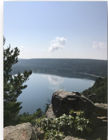
Figure 2 – Devils Lake State Park Baraboo, WI

The jurisdictional boundary of Wisconsin also encompasses 11 federally recognized tribes 4 , including the Bad River Band of Lake Superior Chippewa, Ho-Chunk Nation, Lac Courte Oreilles Band of Lake Superior Chippewa, Lac du Flambeau Band of Lake Superior Chippewa, Menominee Tribe of Wisconsin, Oneida Nation, Forest County Potawatomi, Red Cliff Band of Lake Superior Chippewa, St. Croix Chippewa, Sokaogon Chippewa (Mole Lake), and Stockbridge-Munsee.