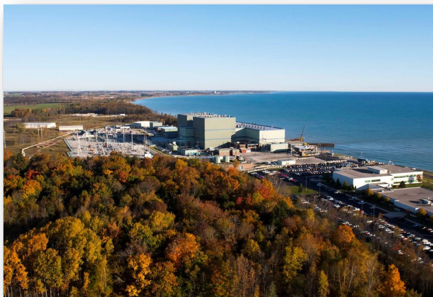
Figure 6 – Point Beach Nuclear Power Plant, Two Rivers, WI.