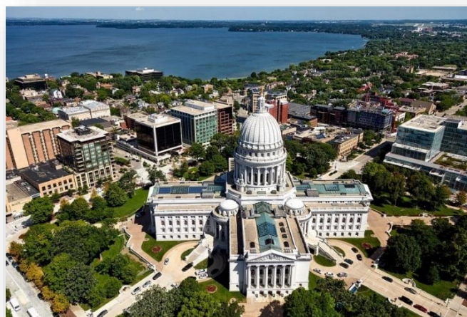
Figure 4 - Wisconsin State Capitol Building