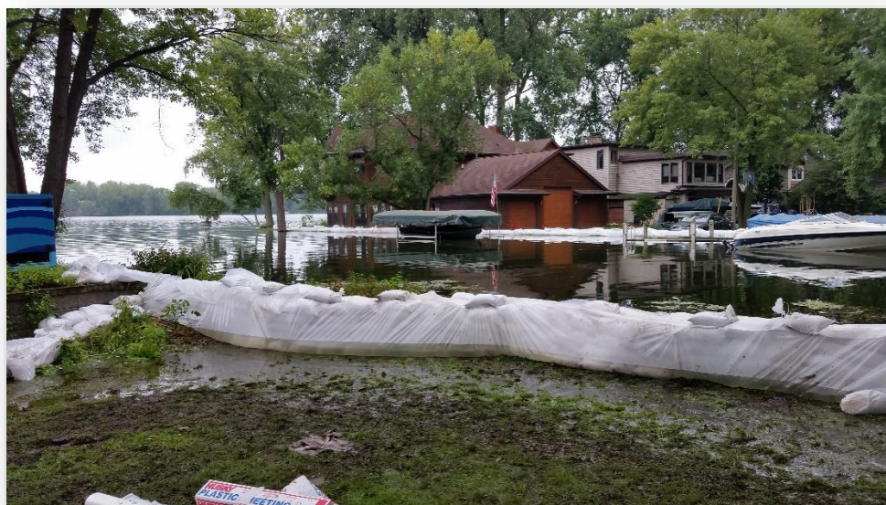
Figure 3 – Sandbags placed to alleviate flooding in Monona, WI

According to the State of Wisconsin's Hazard Mitigation Plan, flooding and tornadoes are the most frequent and damaging natural hazards in the state, followed by severe winter storms and wildfires. Major floods have occurred in eight of the last ten years. With an average of 21 tornadoes per year, Wisconsin ranks 17th nationally in frequency and number of fatalities. Since 2000, Wisconsin has received a total of seven federal disaster declarations involving flooding, severe storms, and tornadoes. In addition, the state received two emergency declarations for snow removal following major winter storms. Record flooding in southern Wisconsin in 2007 and 2008 caused hundreds of millions of dollars in damages to homes, businesses, local infrastructure, and agricultural losses. The August 2007 flooding event caused more than $112 million in damage with over 4,000 households seeking federal disaster assistance. The 2008 flooding event shattered records, with damage exceeding $765 million and more than 40,000 households requesting disaster assistance with FEMA. The 2008 flooding became the most expensive disaster in state history.